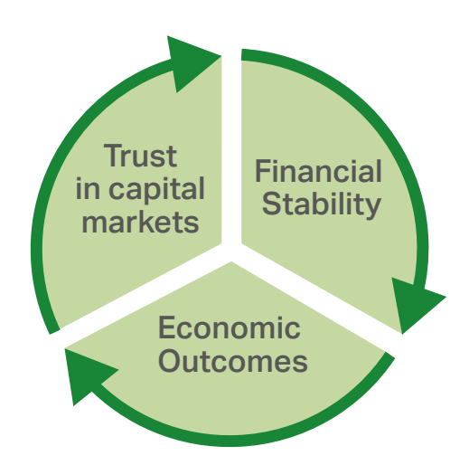
FIGURE 1. Virtuous circle

The relationship between these three categories is shown in Figure 1 below. They are mutually reinforcing and this dynamic is a further reason for greater climate-related and sustainability-related disclosure and UK leadership.